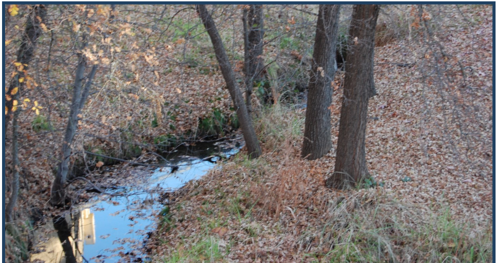
A campus feature , transforming into a teachable classroom

You were born with the ability to change someone's life. Don't waste it!